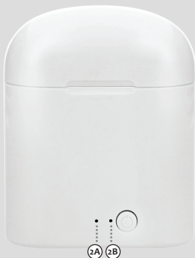
Charging LED Indicators