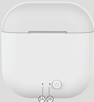
Charging LED Indicators